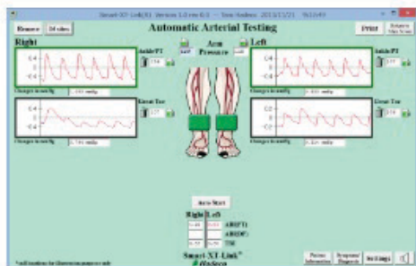
<Automatic Arterial Testing screen>